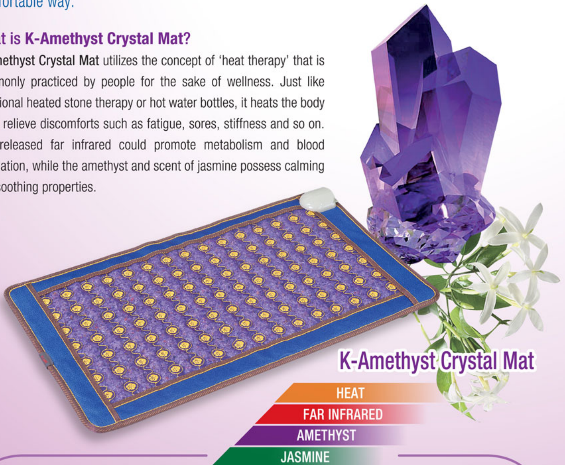
K-Amethyst Crystal Mat

K-Amethyst Crystal Mat utilizes the concept of 'heat therapy' that is commonly practiced by people for the sake of wellness. Just like traditional heated stone therapy or hot water bottles, it heats the body up to relieve discomforts such as fatigue, sores, stiffness and so on. The released far infrared could promote metabolism and blood circulation, while the amethyst and scent of jasmine possess calming and soothing properties.